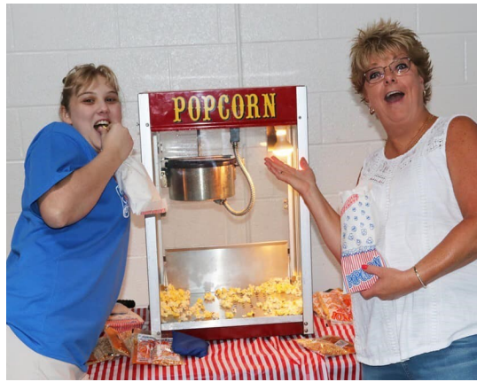
This year's summer camp at Beacon School was the first one managed by ACBDD staff, and it reportedly was the best one yet!