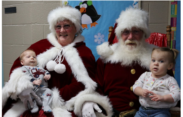
Beacon School successfully hosted the second annual Help Me Grow Holiday Party, which is open to all families enrolled in our Early Intervention Program.