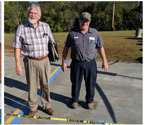
2019 saw a number of improvements to the Beacon School/ ACBDD Administration building, including an expanded parking area.