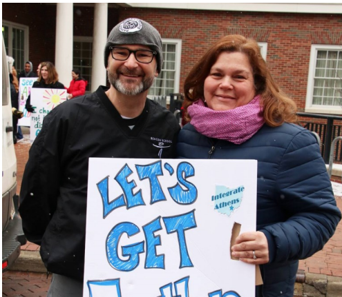
Attendance and excitement increased for the second annual "March on Court Street" for Disability Awareness during March.