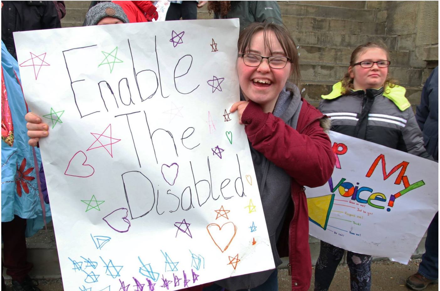
Students proudly display their posters made for the 2nd annual “March on Court Street” for Disability Awareness.

Hundreds of individuals and almost a dozen organizations took to Court Street, laughing and walking hand-in-hand to celebrate the start of Developmental Disabilities Awareness Month.